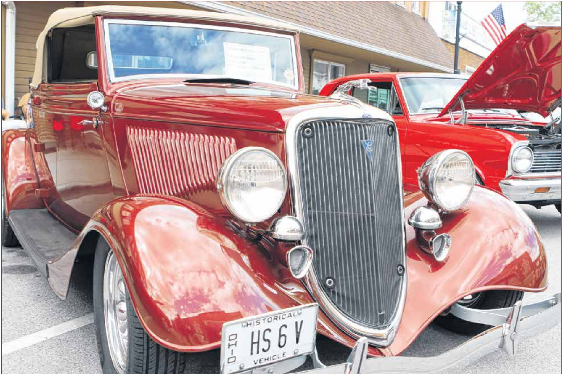
Nevin McDaniel's 1934 Ford features a late-model driveline with a 302 Ford engine and a Corvette rear end. Combines classic styling with updated mechanical components for enhanced performance.