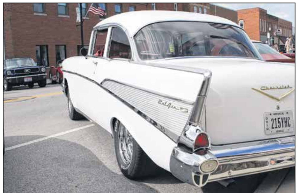
A 1957 Chevy Bel Air