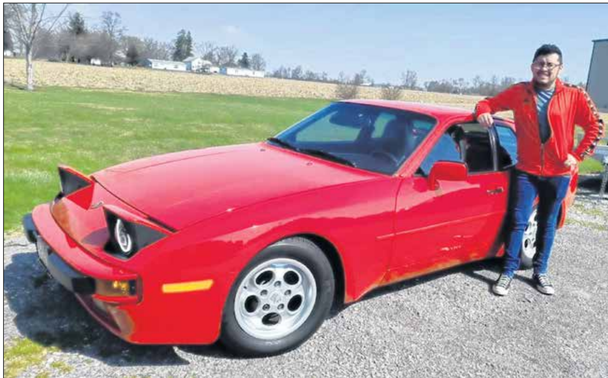
The 1986 Porsche 944 owned by Roy Rojas, of Lima, is in excellent condition with only 95,000 miles on it.

A black leather interior and a sunroof sets off the 1986 Porsche 944 owned by Roy Rojas of Lima.