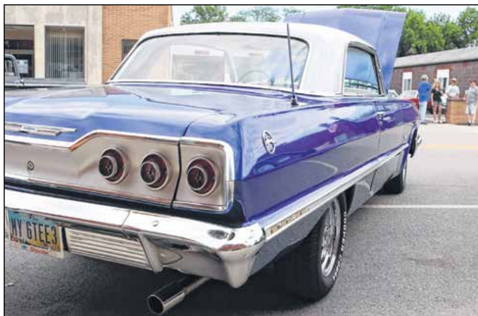
Julie Kurtz' Blue Chevy Impala